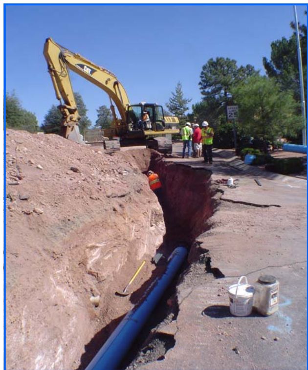
Line "E" - 12" PVC Pipe

Beginning in the fall of 2012, the Town of Payson awarded bids for In-Town Waterline construction. This portion of the project consists of 8 different lines and the Tail-Race Connection. To date three lines have been completed consisting of 5,142 feet of 18" ductile iron pipe, 1,582 feet of 12" PVC pipe and 3,634 feet of 8" PVC pipe. A 4th line is currently under construction, which connects our existing system to the community of Mesa Del Caballo, as well as, the site of the future Water Treatment Plant. The Tail Race Connection at the current SRP Plant is also completed.