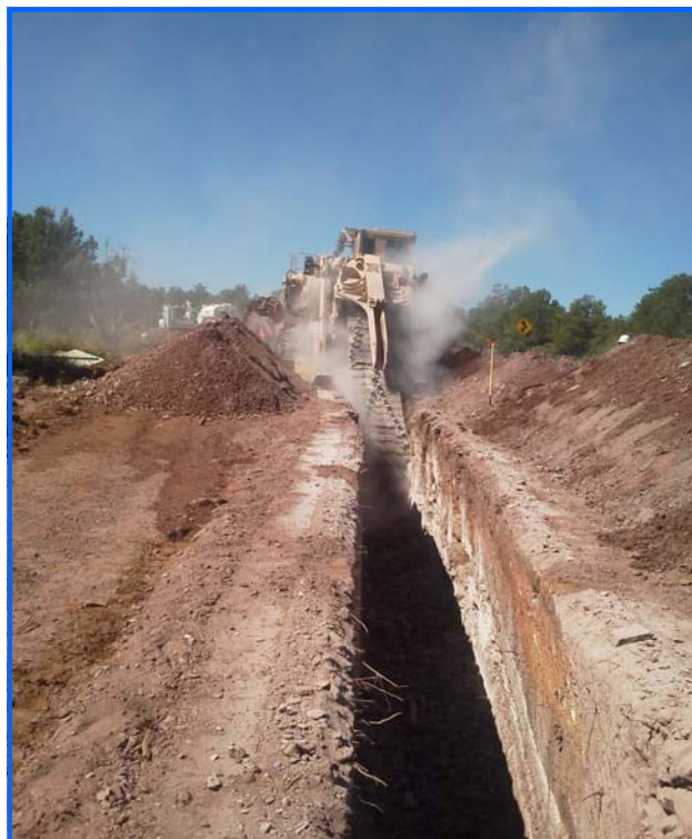
Line "H" - to Mesa Del Caballo and the future site of the Water Treatment Plant